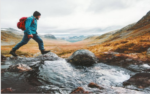
Fighting for our future generations

The application by CENIN will be dealt with by PEDW (Planning and Environment Decisions Wales). Once a formal application has been made, we have approximately 5 weeks in which to lodge objections. We expect planning application to go in soon.