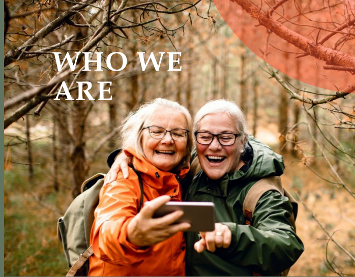
Fighting to protect your heritage

"We are a local group formed to try and prevent the unnecessary destruction of our precious wilderness. We accept that wind turbines are currently a route to hitting renewable targets, but not at this cost. The destruction of our landscape will be overwhelming and permanent"